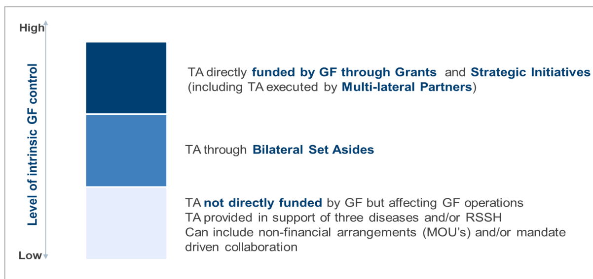
Figure 1: Global Fund level of control over in-country investments in technical assistance and capacity building.

A significant amount of country-level technical assistance is not funded by the Global Fund but benefits grant programs. This includes TA by other donors/financing institutions and Ministries of Health for interventions targeting Resilient and Sustainable Systems for Health or the three diseases. Depending on the financial arrangements, the Global Fund has varying degrees of control over TA in countries.