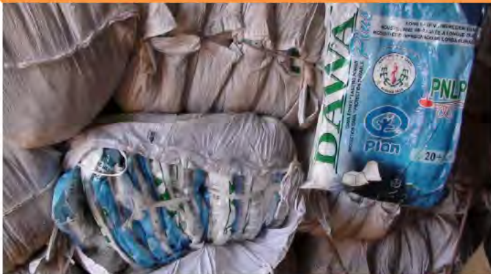
The Counterfeit DAWAPlus bales and net bag

Bales of counterfeit DAWAPlus nets found the Centre Nord region (lot 4).