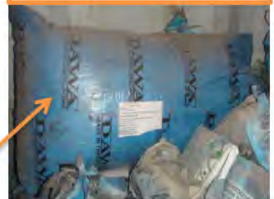
Genuine DAWAPlus bale bag

The genuine Tana Netting bale bags are blue with black printing on the sides