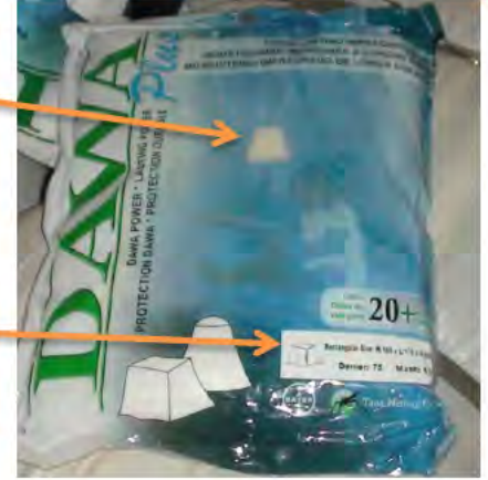
Genuine DAWAPlus net bag

The counterfeit bags do not have a white sticker on the front of the package detailing the dimension of the nets