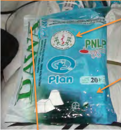
Counterfeit DAWAPlus net bag

The counterfeit net bags have specific Burkina Faso logos on the bags; while the authentic net bags do not have the logos on the net bags