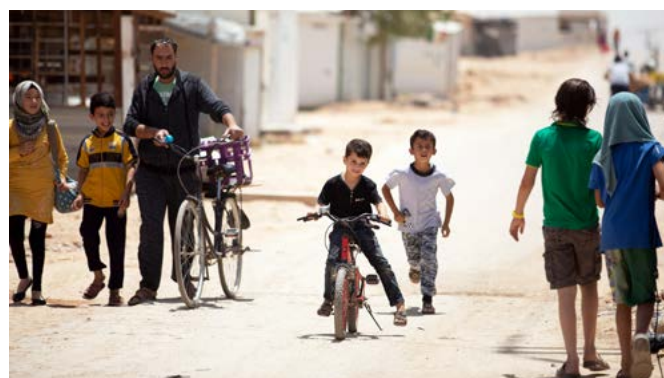
Za'atari Refugee Camp for Syrian refugees, Jordan.

In November 2020, KfW Development Bank, representing Germany, and the government of Jordan signed a D2H agreement, converting €10 million in ODA claims into support for Syrian refugees in Jordan through the Global Fund's Middle East Response 2 program. This debt swap increased resources available for TB diagnosis, surveillance and staffing. It provided additional training of medical and community actors; funded laboratory equipment and staff, allowing for better pandemic preparedness and responses to other endemic diseases like HIV and TB; and strengthened Jordan's Health Management Information System, relied upon for national strategy coordination and management and critical for timely reporting and surveillance of disease outbreaks.