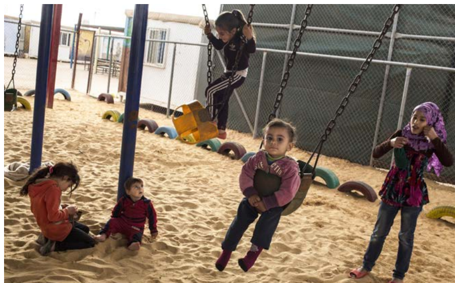
Syrian refugees in Zaatari refugee camp in Jordan receive prevention education, diagnosis and treatment for TB through the Middle East Response Initiative. Over 18,000 children are enrolled in Zaatari's 32 schools. With more than 60 babies born every week, the camp is home to increasing numbers of Syrian children who have never lived in the country their families fled.