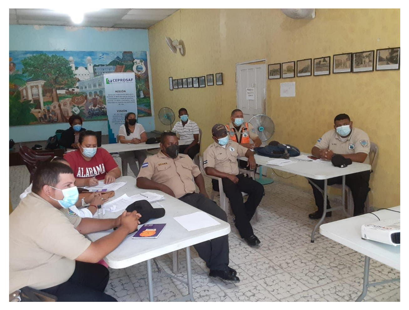
<u>CEPROSAF</u>, Taller de Capacitación Sobre Derechos Humanos a la Policía Municipal en la ciudad de La Ceiba, Atlántida, 14–16 abril 2021

Concerns continue regarding delayed or otherwise inadequate access to health care in prisons, including access to HIV testing and access to HIV care (including ARV), resulting from bureaucratic hurdles when seeking access to health care in prison, HIV stigma in prison (based on a lack of information about HIV and risk of transmission) and the widespread attitude that people lose their human rights upon being imprisoned. $$$$$$$$$$$$$$$$$$$$$$$$$ There appear to have been some activities to sensitize prison workers and authorities, but these are either ad hoc or ones in progress where the outcome remains to be seen. For example, CONADEH and certain civil society organizations participate in the Roundtable on Prison Health (Mesa de Salud Penitenciaria); CONADEH has contributed to a training session on human rights for this Asociación Kukulcán reports having done some training in 2020-2021 with body.** prison officials regarding the rights of key populations (particularly people living with HIV, GBMSM, and trans women).<sup>†††††††††††††††</sup> And in Puerto Cortes, the Liga de Lactancia Materna reports that its efforts in collaboration with the local human rights network led to engagement with the prison authorities led to a multi-stakeholder agreement to establish a local oversight body, supported and coordinated by CONAPREV, to monitor the situation inside the